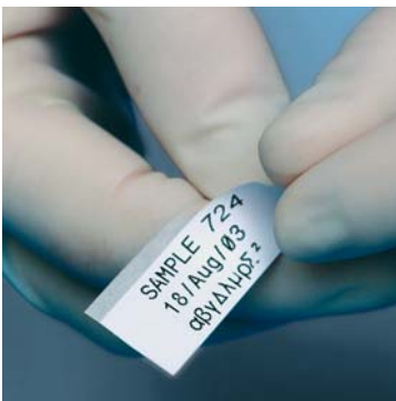
Exposed edge makes peeling easy—even with gloves.