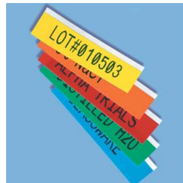
Colored tapes for general purpose labeling.