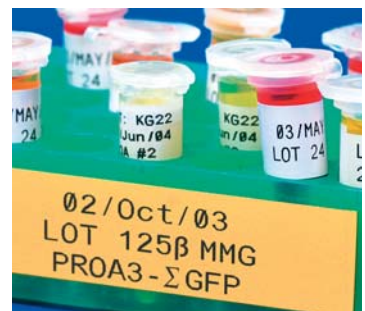
Specific laboratory symbols