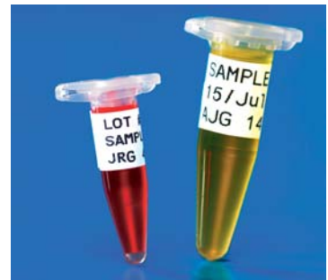
Pre-programmed vial ID sizes (0.6, 1.5 & 2 ml)