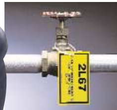
Type size from 0.08" to 1.70"